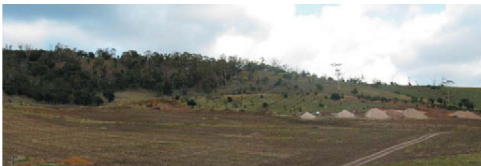
new vineyard site

Considering the year, biodynamic practices in our vineyard performed well. We believe without biodynamic preparations we may have experienced some problems with powdery mildew, as did many vineyards in Southern Tasmania. Commencing immediately we have converted the other two thirds of our vineyard to biodynamics, which means the complete elimination of herbicides and soft fungicides.